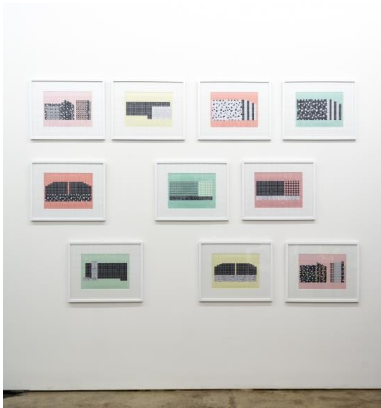
Edra Soto: Casas-Islas | Houses-Islands, 2021, installation view, New York City.