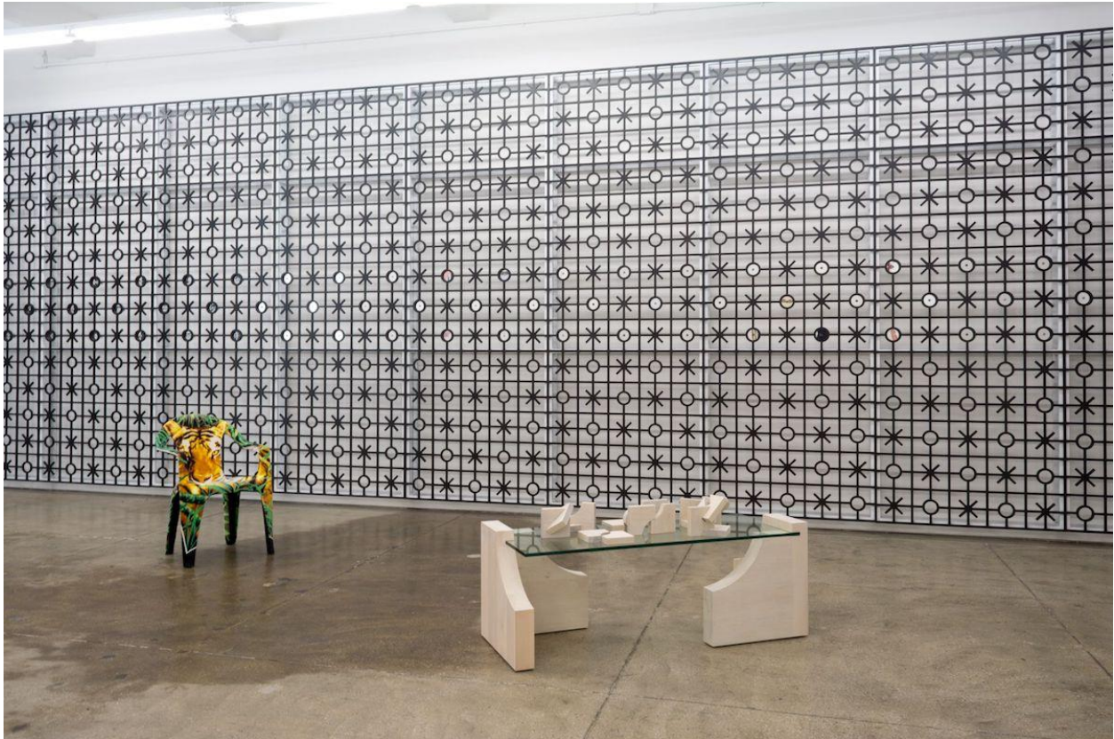
Edra Soto: Casas-Islas | Houses-Islands, 2021, installation view, New York City.

Edra Soto: Casas-Islas | Houses-Islands at Morgan Lehman Gallery