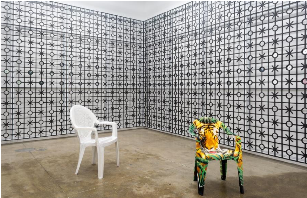
Edra Soto: Casas-Islas | Houses-Islands, 2021, installation view, New York City.

Through this work, the artist opens their home to us, using the representation of something that's supposed to signal outsiders "do not pass". Rather than act as a barrier between two places, two peoples, two narratives, Soto flips the fence on its head and creates a portal. This iteration of GRAFT turns casual intimacy into a concentrated engagement of the artist's reality and narrative, which are already separated from Soto by land, financial circumstances, and other elements of life that factor into the separation between a diaspora and their home.