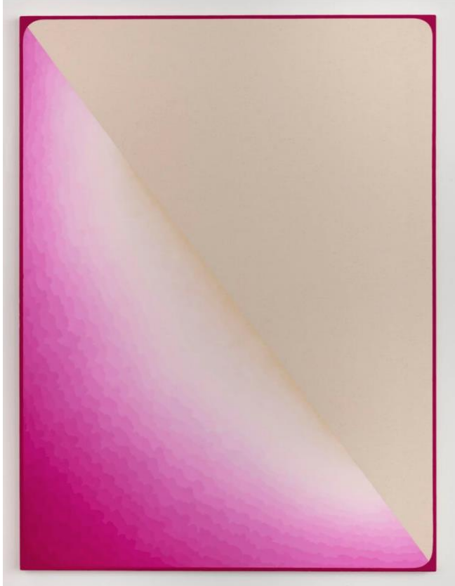
(By Slip, 2020, Audrey Stone)

In some cases Stone is content with simple juxtaposition, but often she creates flares or vibrations at these boundaries, as in the diagonal horizons of “By Slip” and “By Song.”