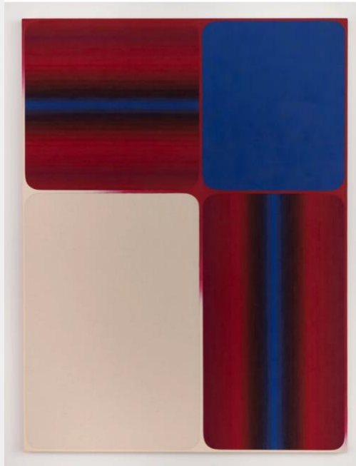
By Heart, 2020, Audrey Stone

The use of lacunas of unpainted space - absence made visible - in several pieces is a repeated memento mori.