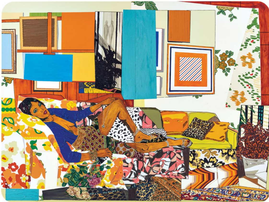
Mickalene Thomas’s 2012 Tamika sur une chaise longue avec Monet , on view at the Seattle Art Museum.

In this show, three celebrated African-American artists are giving the history of European genre painting a bold shake-up. Expect vibrant large-scale tableaux that challenge traditional notions of identity in art, such as Mickalene Thomas’s restaging of famous works by the likes of Manet and Monet with glittering, provocatively dressed black women. seattleartmuseum.org