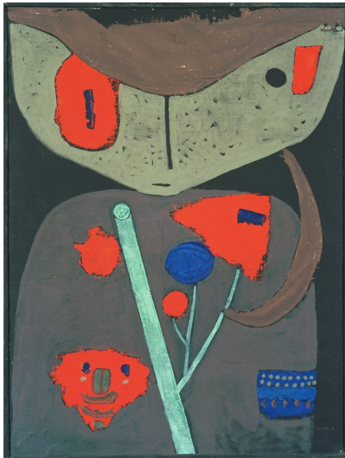
Paul Klee, Figure of the Oriental Theater, 1934.

While Klee’s style is well known, his influence on American abstraction has been largely overlooked—until now. In collaboration with Switzerland’s Zentrum Paul Klee, the Swiss-German painter’s work is presented in dialogue with that of Jackson Pollock, Robert Motherwell, and Adolph Gottlieb. phillipscollection.org