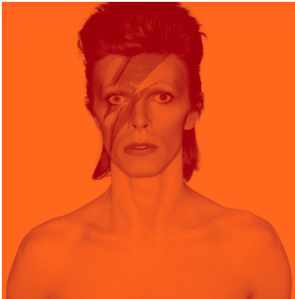
Photograph from the album cover shoot for Aladdin Sane , 1973.

With more than 300 objects from David Bowie’s 75,000-piece collection, this show offers an in-depth look at the unmatched career and personal life of the music and style icon. After touring the world, the show fittingly returns to New York City, where Bowie lived for over 20 years, for its final run. brooklynmuseum.org