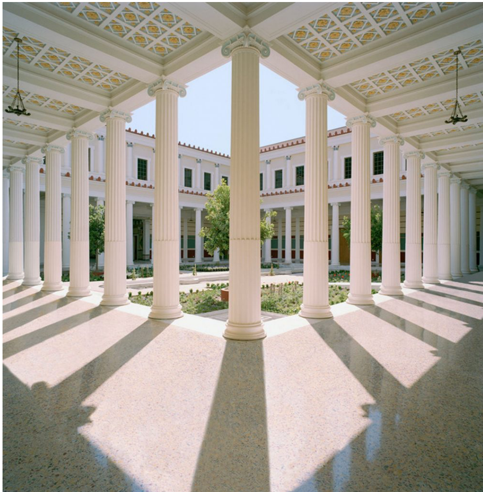
The Inner Peristyle at the Getty Villa.

Founded in 1974 by J. Paul Getty to house his expanding collection of antiquities, the Getty Villa is unveiling a complete reinstatement in April and debuting a refreshing exhibition of contemporary art that engages with the philosophy of Plato. Artists include Michelangelo Pistoletto, Mike Kelley, Paul McCarthy, and Jeff Koons. getty.edu