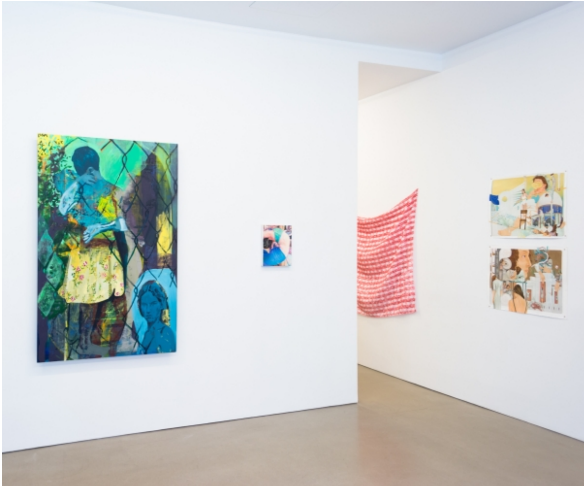
Installation view: RISD MFA Exhibition at Morgan Lehman

534 West 24th Street, New York, New York 10011