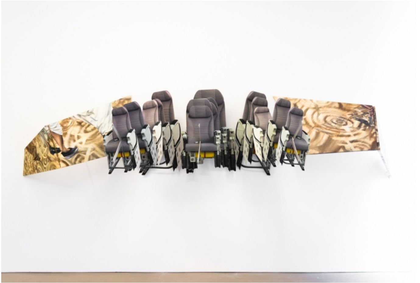
Installation view: RISD MFA Exhibition at Morgan Lehman

534 West 24th Street, New York, New York 10011