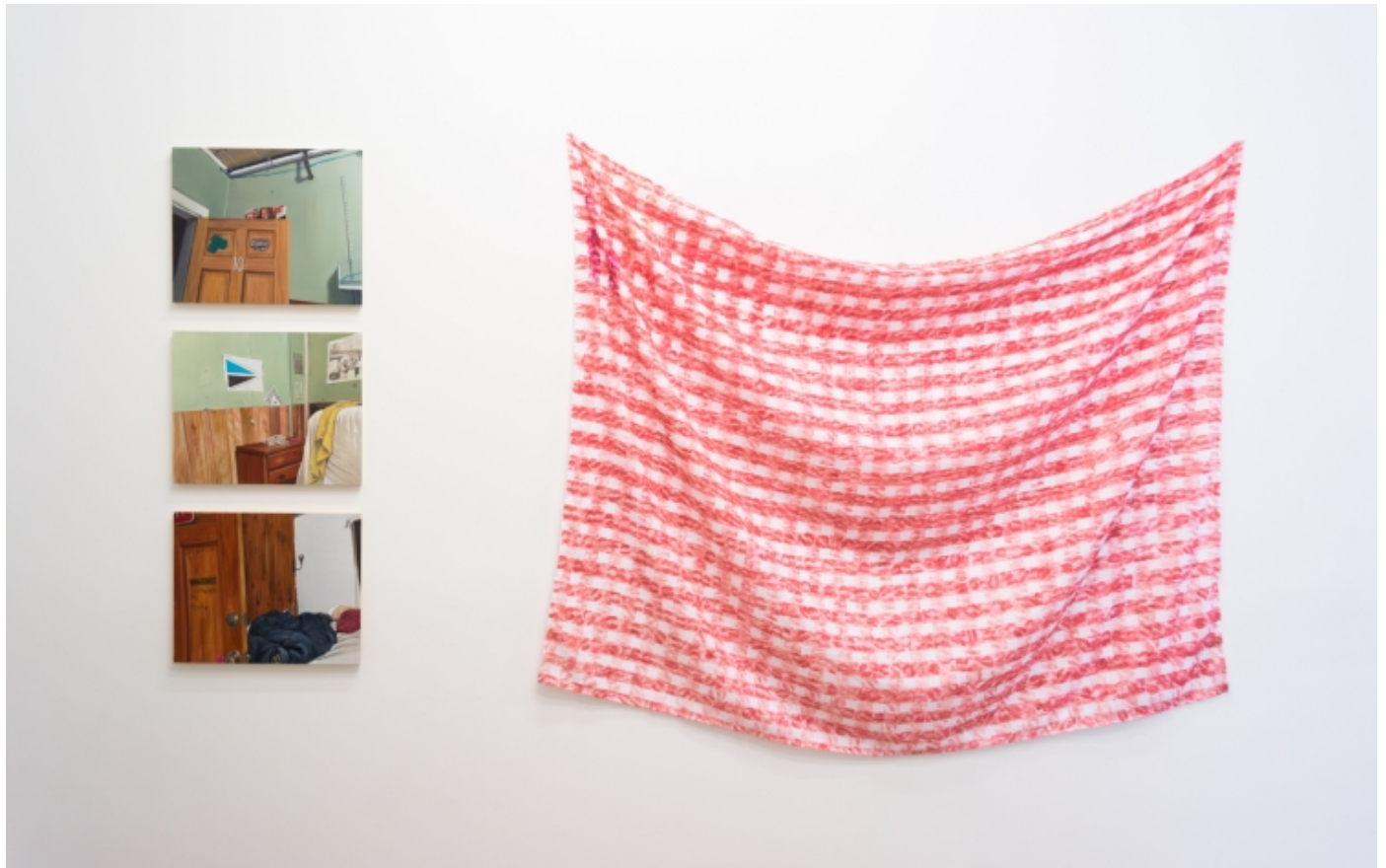
Installation view: RISD MFA Exhibition at Morgan Lehman

534 West 24th Street, New York, New York 10011