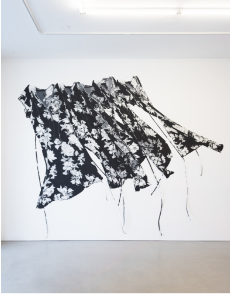
Installation view: RISD MFA Exhibition at Morgan Lehman

534 West 24th Street, New York, New York 10011