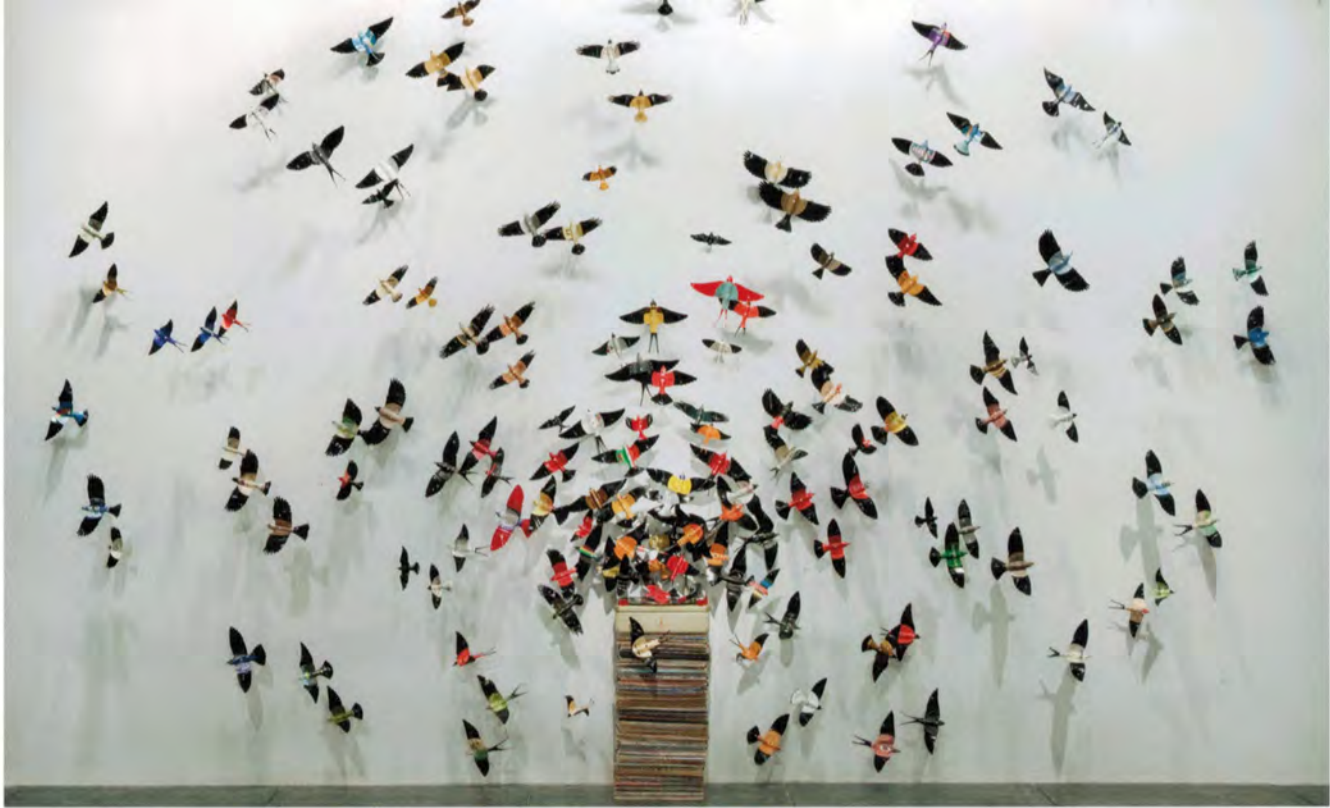
Above: Diaspora , 2010. Vinyl LP records, turntable, record covers, and wire, dimensions variable. Below: Oculus , 2012. Wooden chair, found aluminum cans, wire, and soot, dimensions variable.