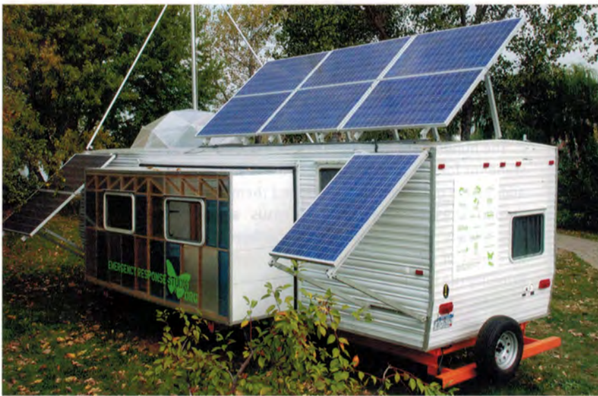
Above: Belt , 2015. Discarded liquor bottles, belts, and rivets, 8 x 324 x 1.5 in. Left: Emergency Response Studio , 2008. FEMA-type trailer, sustainable building materials, and solar and wind power systems, 45 x 28 x 18 ft.

RP: You have also manipulated vinyl LPs to create bird forms.