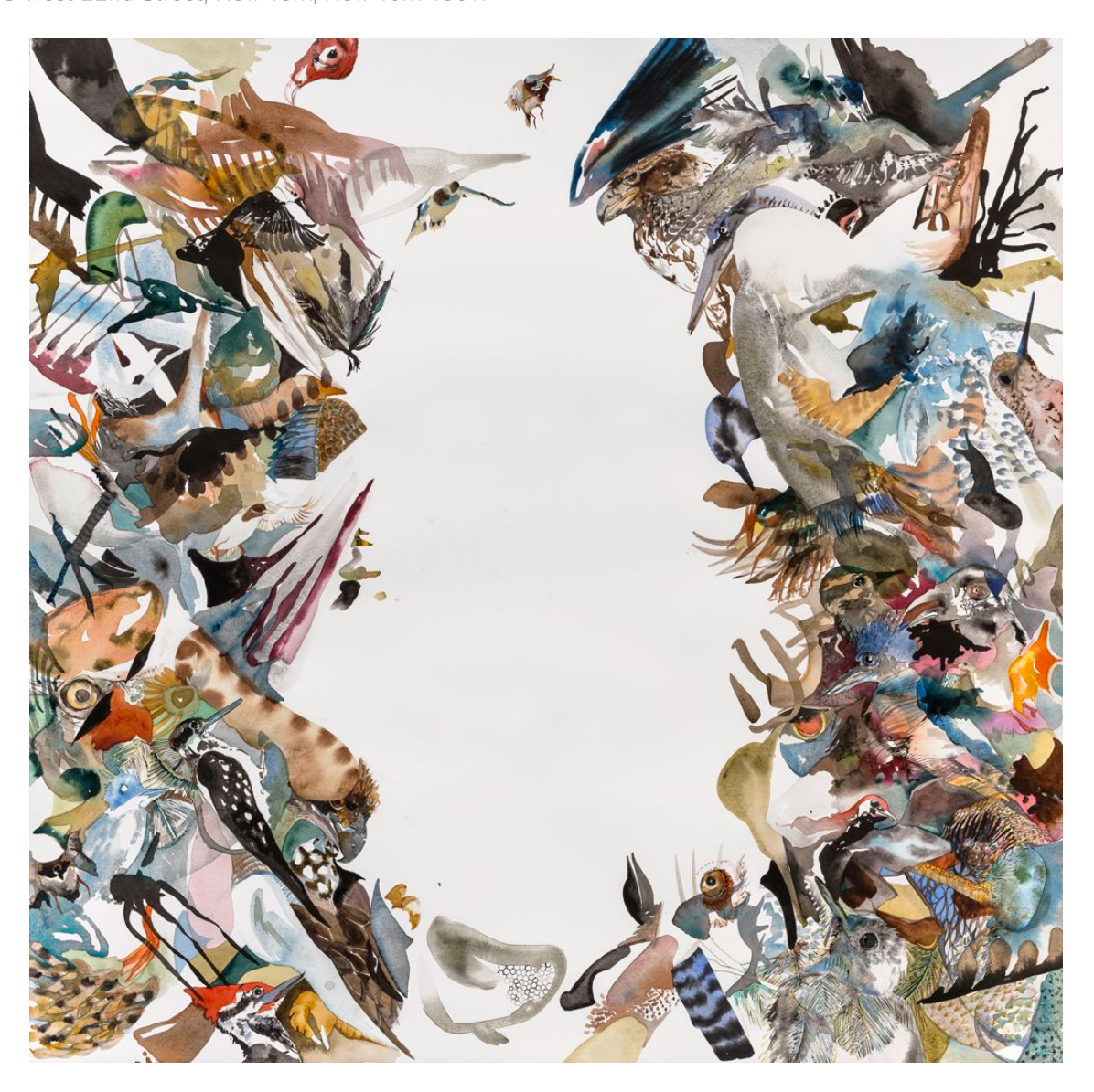
Untitled (TH-14), 2016, watercolor on paper, 54" x 54".