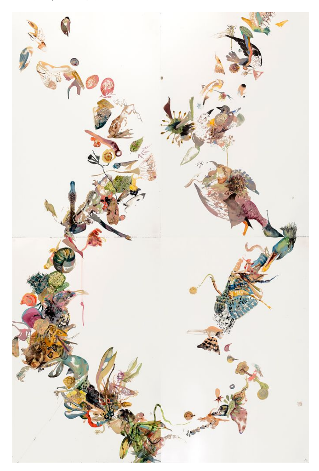
Untitled (TH-22), 2016, watercolor on paper, 95" x 62".

535 West 22nd Street, New York, New York 1001