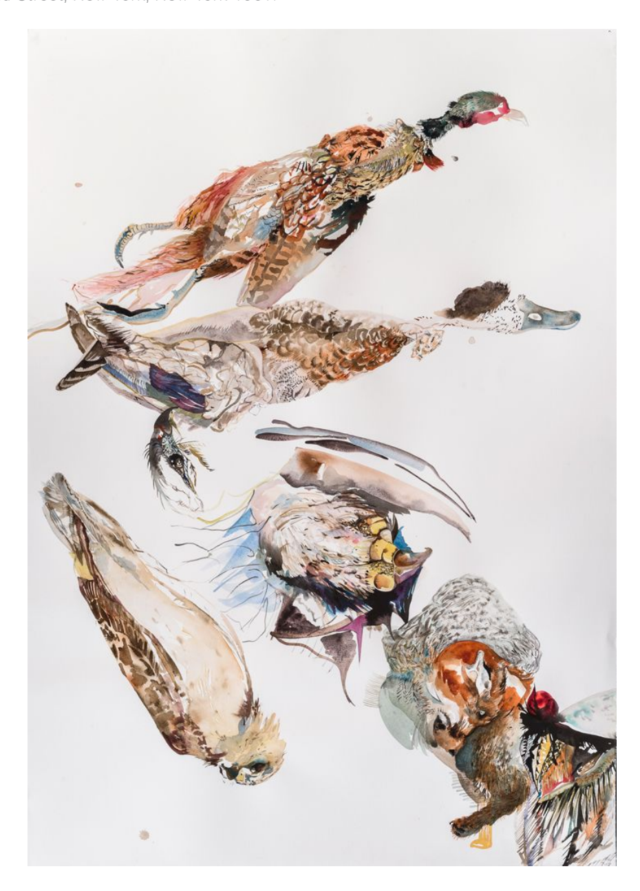
Untitled (T-18), 2015, watercolor on paper, 41.5" \times 29.5".

535 West 22nd Street, New York, New York 10011