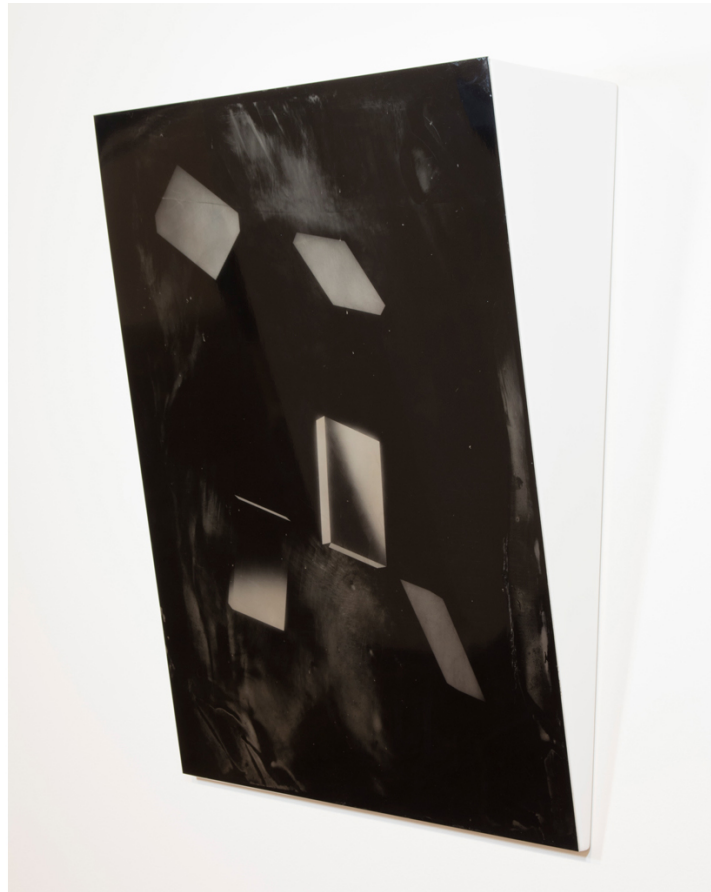
Image above: © Brittany Nelson, Monolith #3, 2016 / courtesy of Morgan Lehman Gallery

535 West 22nd Street, New York, New York 10011