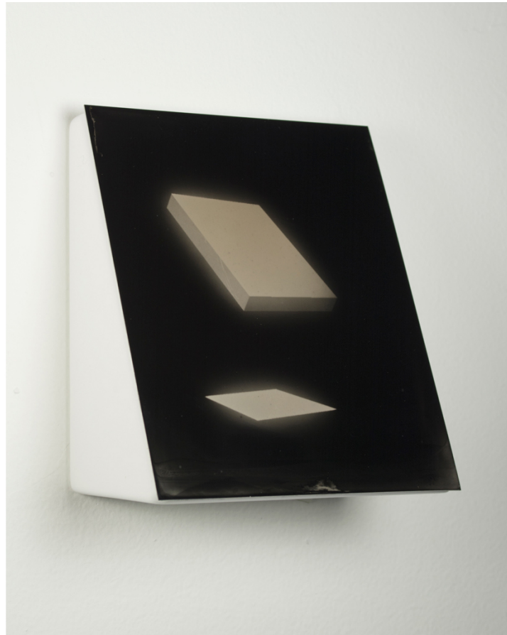
Image above: © Brittany Nelson, 3D Square with Shadow 3, 2016 / courtesy of Morgan Lehman Gallery

535 West 22nd Street, New York, New York 10011