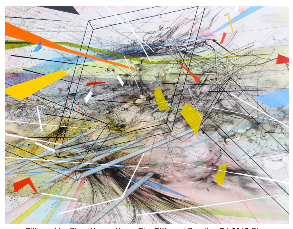
Billboard by Chee-Keong Kung, The Billboard Creative Q4 2015 Show Location: 3rd West of Cochran, Los Angeles

So be careful while driving. Don't get overwhelmed by the powerful images chosen for these billboards — images ranging from the thoughtful and ethereal face of a child by artist Kim McCarty to the exploding abstract composition painted by Chee-Keong Kung. The whole project was conceived by The Billboard Creative, a LA-based nonprofit that takes unused billboards and turns them into public art, displayed in a quintessentially Los Angeles manner: along and above the city's streets.